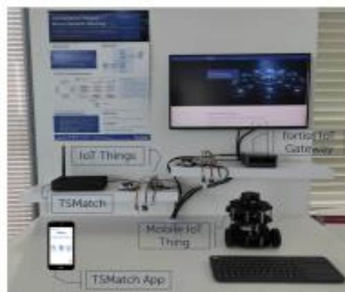
Fig. 3. The TSMatch demonstrator at the forties IIoT Lab.

We have established a TSMatch testbed on the forties IIoT Lab 14 based on the operational requirements generated from the TSMatch integration on real-world industrial use-cases, as shown in Fig. 4. As shown in Figure 3, the testbed consists of the following parts: