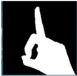
Figure 4 (a) Image after binarise.

the robustness of our system to changes in lighting or illumination. Non-black pixels in the transformed image are binarised while the others remain unchanged, therefore black. The hand gesture is segmented firstly by taking out all the joined components in the image and secondly by letting only the part which is immensely connected, in our case is the hand gesture. The frame is resized to a size of 64 by 64 pixel. At the end of the segmentation process, binary images of size 64 by 64 are obtained where the area in white represents the hand gesture, and the black coloured area is the rest.