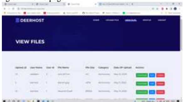
fig.7.2 view files